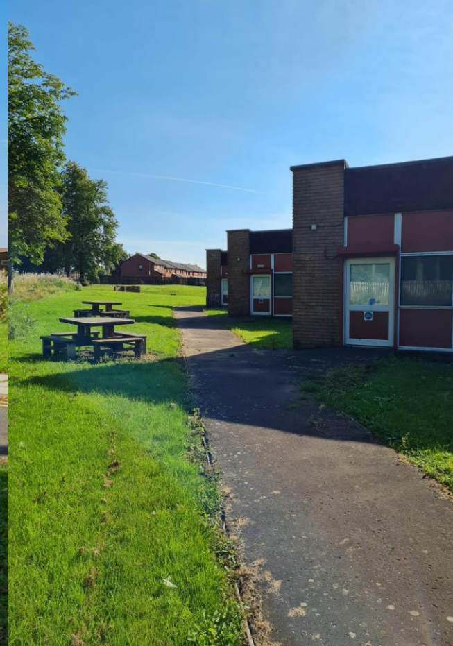
The Edward Lawson Centre