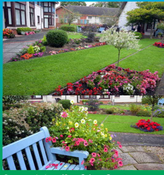
Communal winner Kerr Grieve Court Retirement Housing

As well as news specific to your local area you can choose more