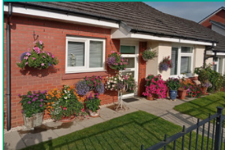
Individual winner Jim Leonard

Stay up to date with what's happening in your local area by signing up to email alerts and our local town Facebook pages.