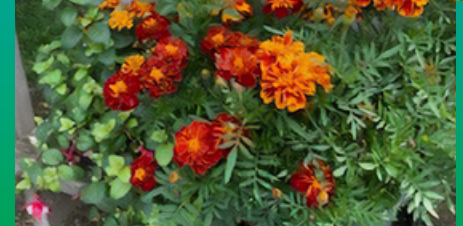
Communal winner Drummond Drive Retirement Housing