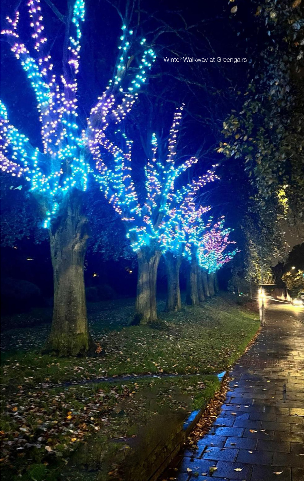
Winter Walkway at Greengairs