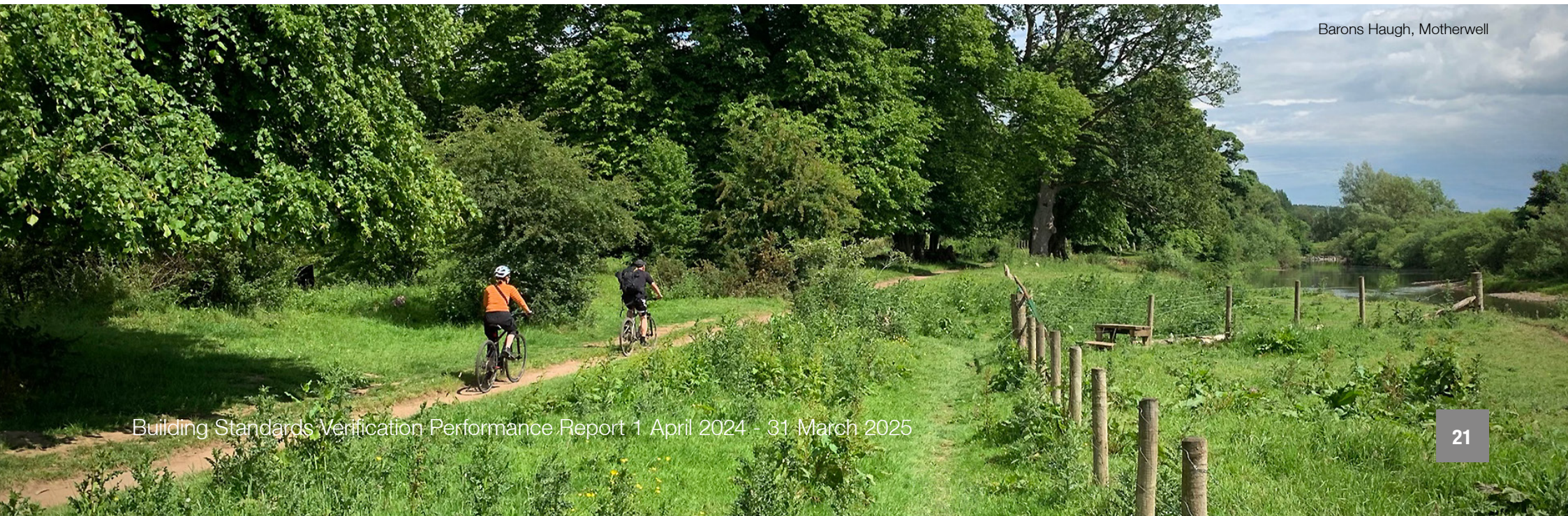
Barons Haugh, Motherwell

Team members are also encouraged to become involved in particular projects to utilise skills or experience to aid personal development as well as benefit the service as a whole.