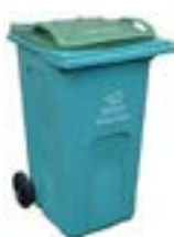
Green lidded bin